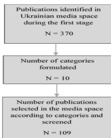
Fig. 1: The Scheme of Research Continuity.

The process of research is schematically depicted on Figure 1 below: